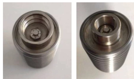
Version 2 in Year 2015