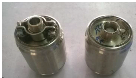
Version 1 in Year 2009